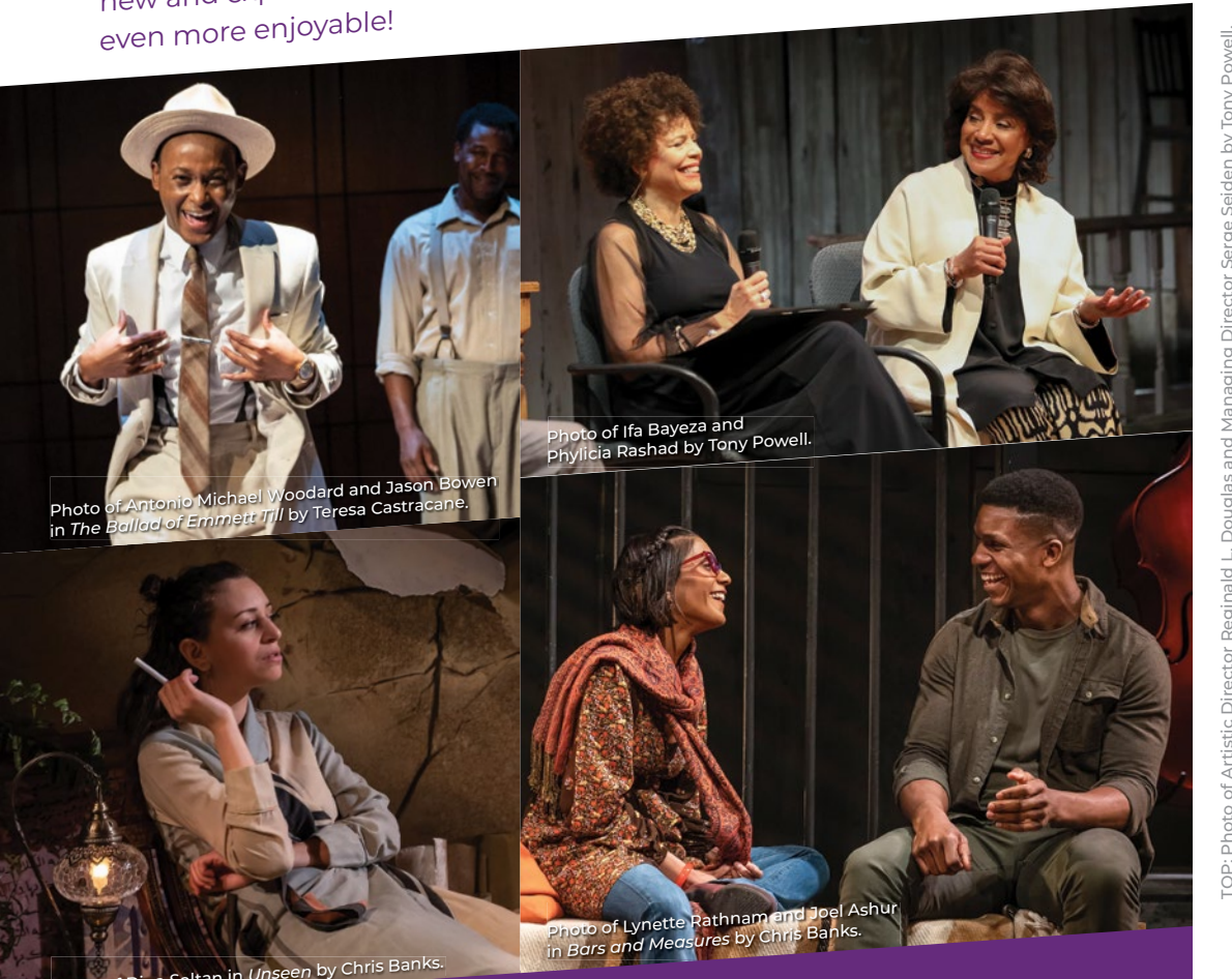
Soltan in Uns

From groundbreaking new musicals and riotous comedies to thrilling world premieres and new works by prominent theater talents — Mosaic's 2023-2024 Season is a must-see. Subscribing comes with new and expanded benefits that make your theater-going experience