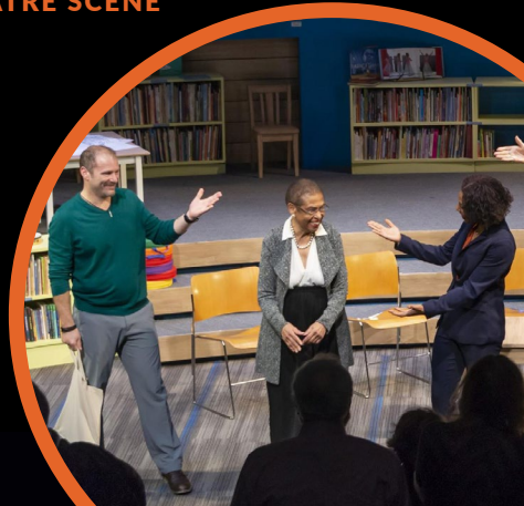
Photo: Eureka Day ensemble

The Honorable Eleanor Holmes Norton joined the cast on Opening Night in the role of Winter.